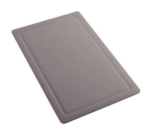
HPDE Chopping board GREY 8657 002