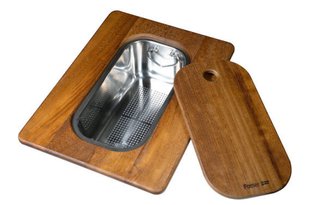
Iroko-wood sliding chopping board with stainless steel colander 8644 044